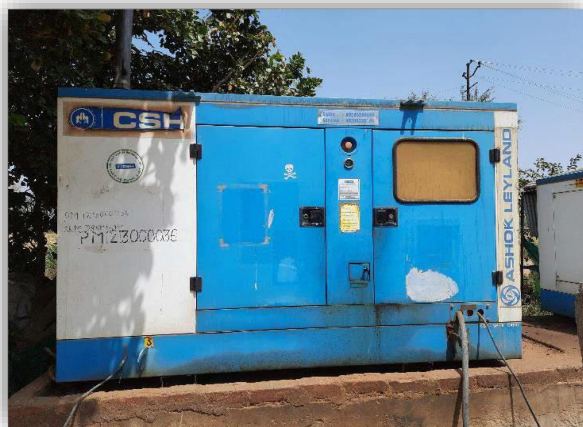
DG set at Aligarh