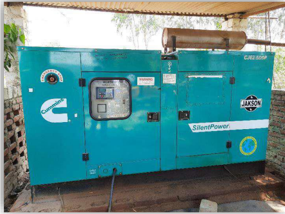
DG sets at Etawah site