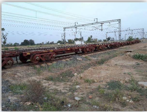
BLC wagons at Firozabad