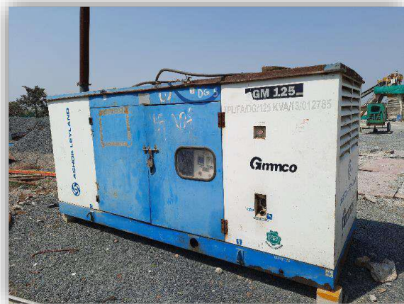
DG set at Firozabad site