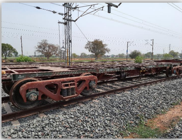
BLC Wagon at Aligarh