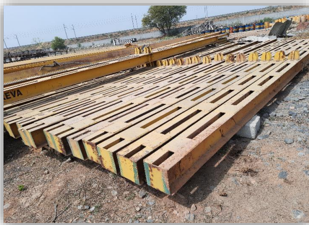
Gantry Crane at Aligarh site